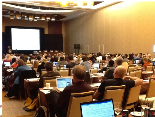
Board review Attendees Embraced Technology with their Mobile Devices and Laptops

the AAP Florida Chapter Section on Young Physicians for a lunch session. The course was a huge success!!!